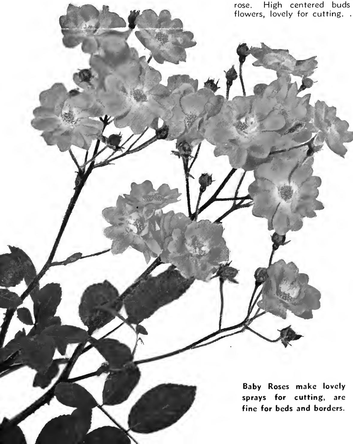
Baby Roses make lovely sprays for cutting, are fine for beds and borders.